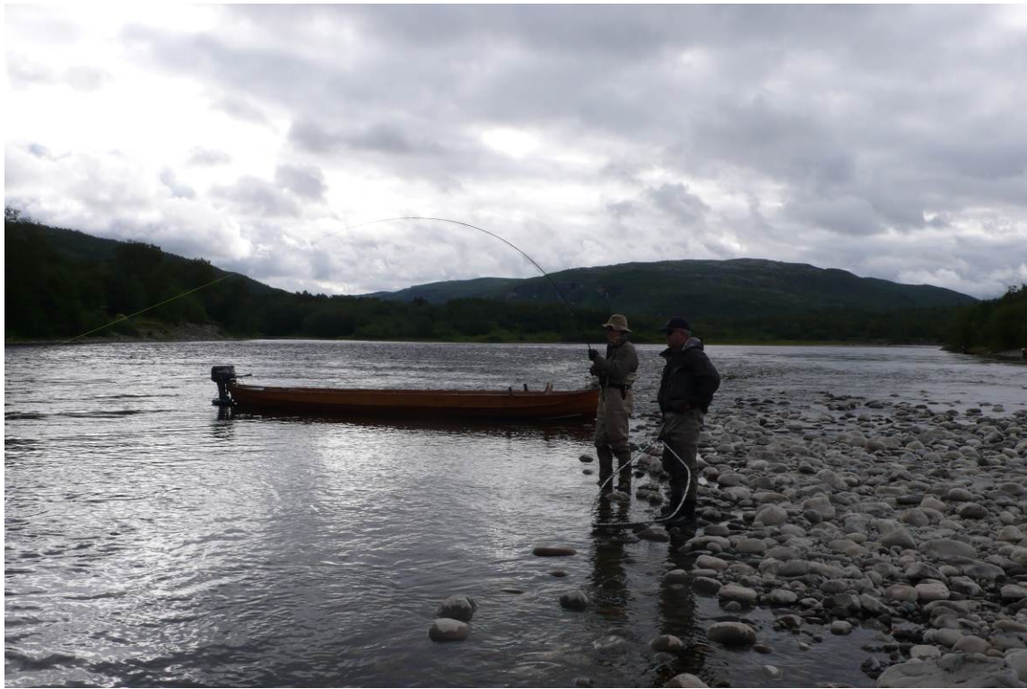
Fighting an Alta salmon at the Bollo pool.