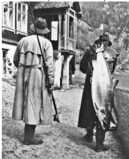
From the good old days in Bolstad. Are we able to get there again?

Bolstad (lower part of River Vosso) has been closed for fishing for several years and the magnificent stock of large grown salmon has been on the brink of extinction. A project involving many stakeholders has the last years worked to reestablish the native stock from a live gene bank. Last year and this year's test fishing has given very positive indications of a recovering stock. For the 2013 season it is expected that many fish in the 30 – 40 pound range will return!