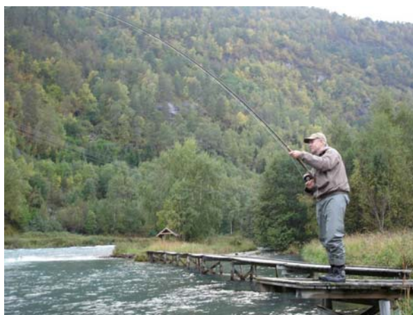
Platform fight, Aarøy.