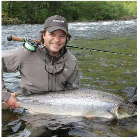
A large salmon of the River Aa.